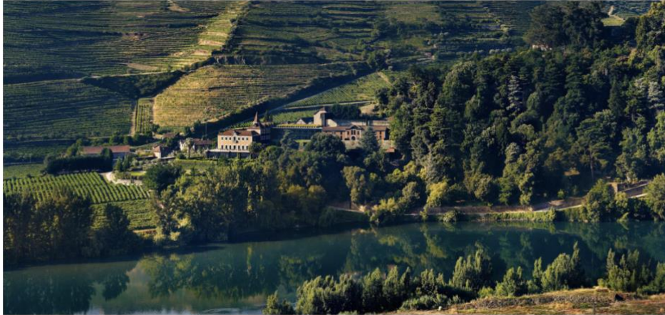
Six Senses Duoro

PUBLISHED: FEB 22, 2023