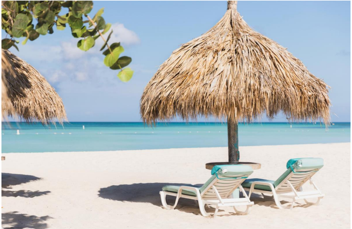
Boardwalk Boutique Hotel