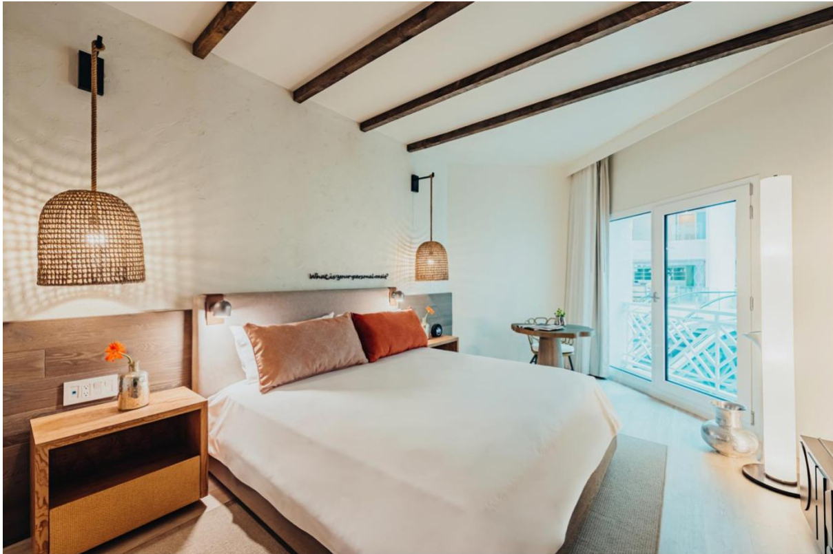
Renaissance Wind Creek Aruba Resort