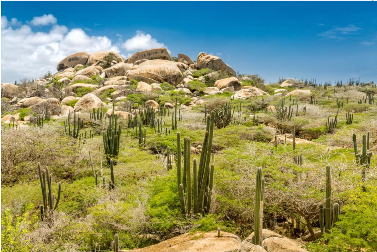
Aruba has lots of cactus-strewn landscapes

Parasailers glide above the sea like confused jellyfish, running laps parallel to the shore, and a gangly pelican follows us as we aim for the next bay. I'm on a sailing and snorkelling tour around the island's northwest coast, with Pelican Adventures, and feel slightly out of my comfort zone (from £49; pelican-aruba.com).