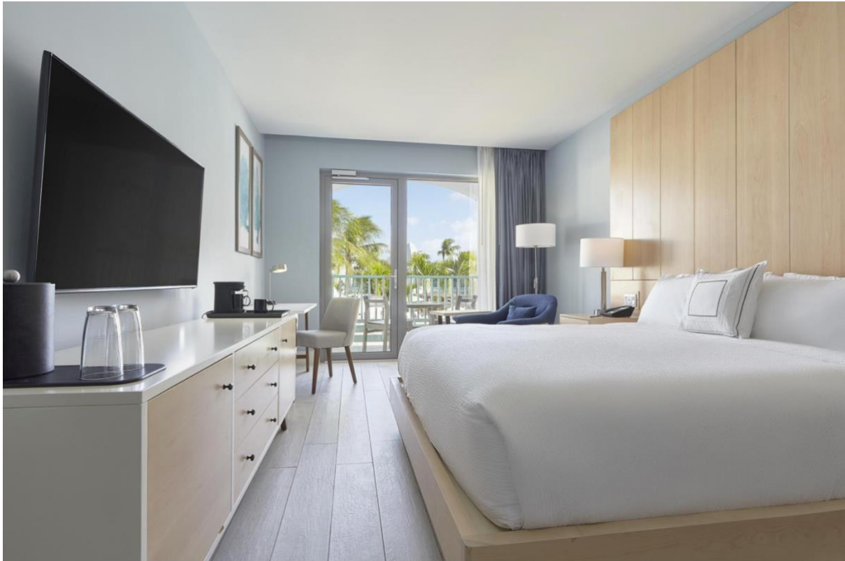
Courtyard Aruba Resort