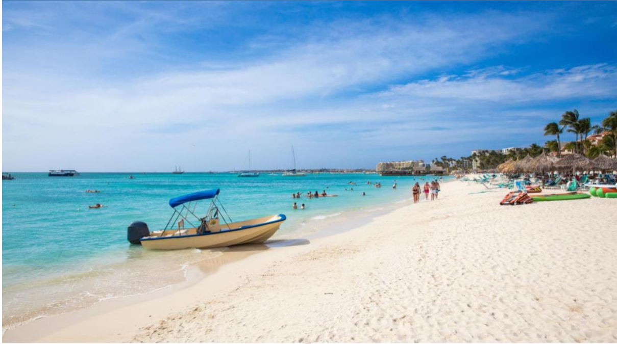
Palm Beach, Aruba

New direct flights will make captivating Aruba, with its clear seas and unexpected wildlife, a hit with sunseekers