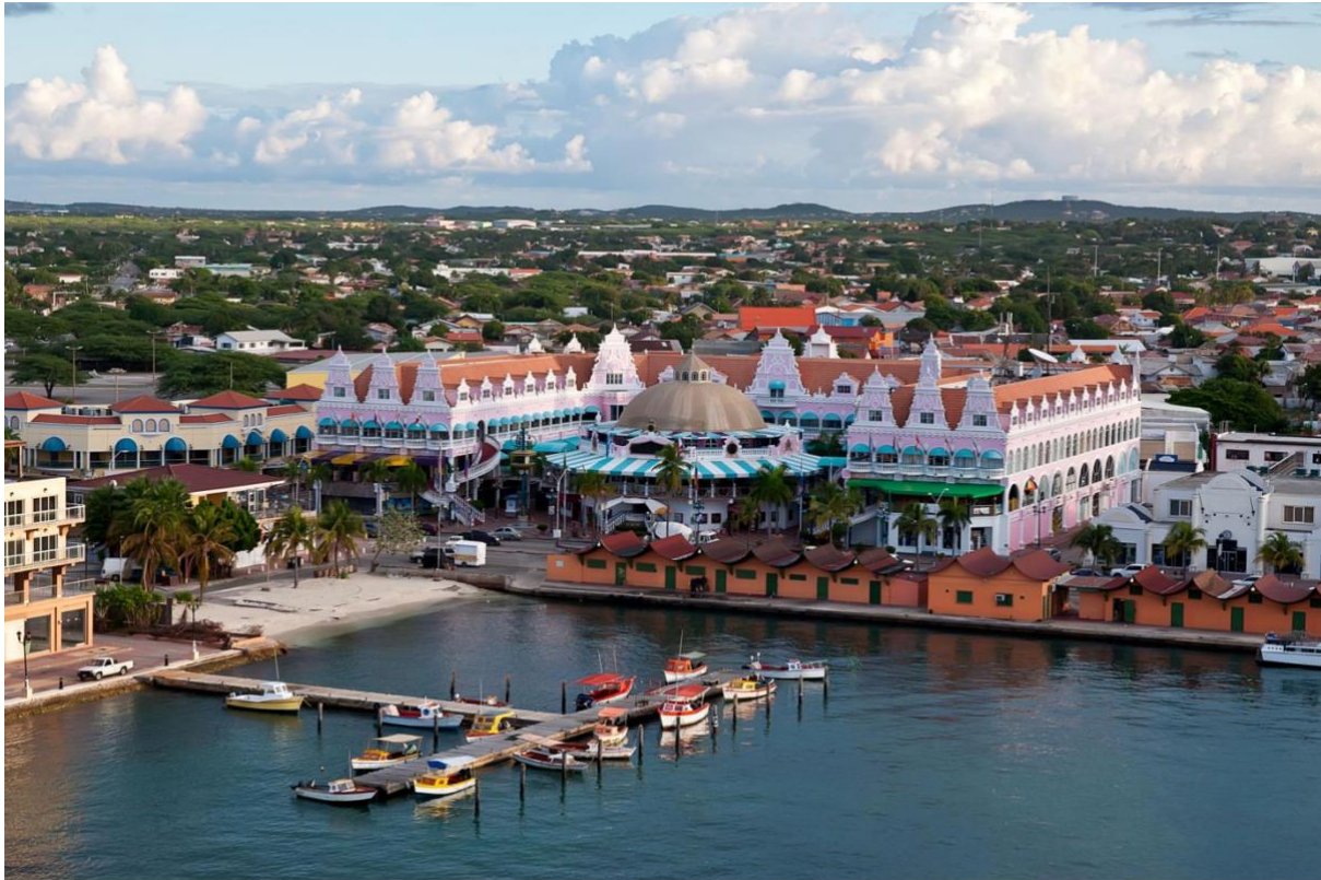
Oranjestad, Aruba's capital

Aruba has long been popular with Dutch and American visitors, and its tourism offer is a well-oiled machine. Palm Beach, with its casinos, bars, restaurants, watersports centres and malls, is the hub; fronting its two-mile beach are resorts from Riu, Hyatt, Hilton, Ritz-Carlton and Marriott. The Embassy Suites by Hilton opened this month, and a new St Regis will open in 2024 to complete the big brand line-up at the island's northwest tip, marked by the towering baton of the California Lighthouse. Meanwhile, at the other end of the island, a new 600-room hotel will bring tourism to Baby Beach.