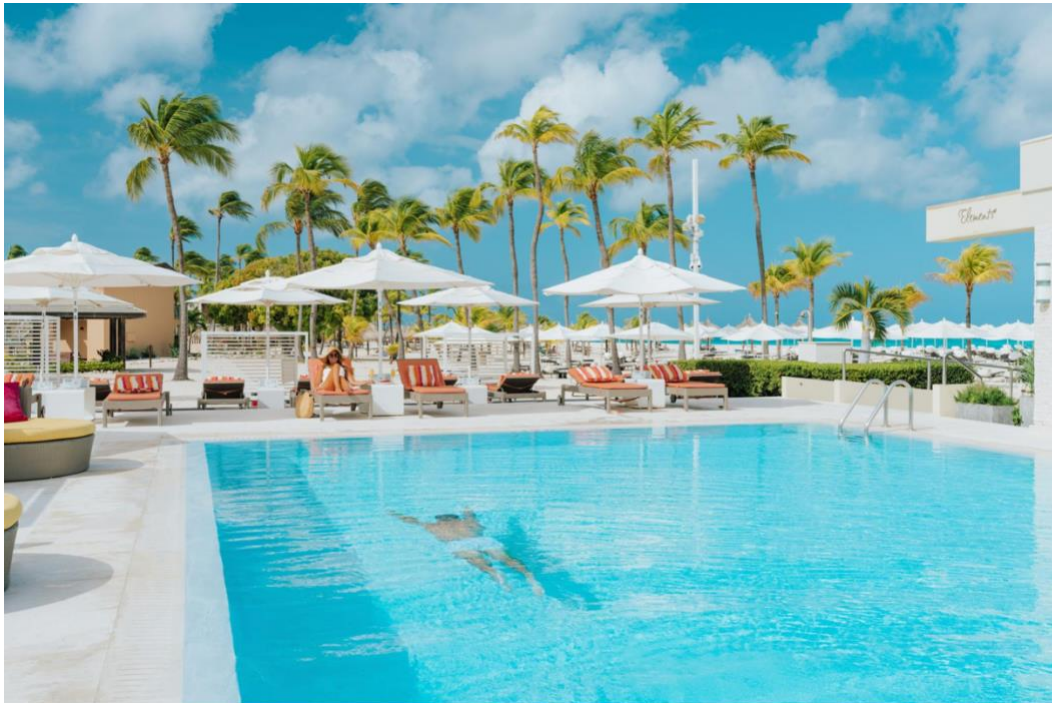
Bucuti & Tara Beach Resort

Later, I head back to the tranquil waters of the west coast for a languid soak. The pina colodas at Tamarijn's thatched Bunker Bar, which sits above a Second World War bunker, can wait a little longer. Instead, at Malmok Beach, I step from a limestone terrace into chest-height waters that lift me up and down with a gaggle of curious bright blue fish. Four bobbing bottoms 50m from shore tell me I'm in the right place for some good snorkelling. The swimmers have not looked up for ten minutes, so I guess there's something there worth the effort of joining them. I arrive just in time to see three turtles rise slowly to the surface. And just like that, the creatures of the deep don't seem so scary any more.